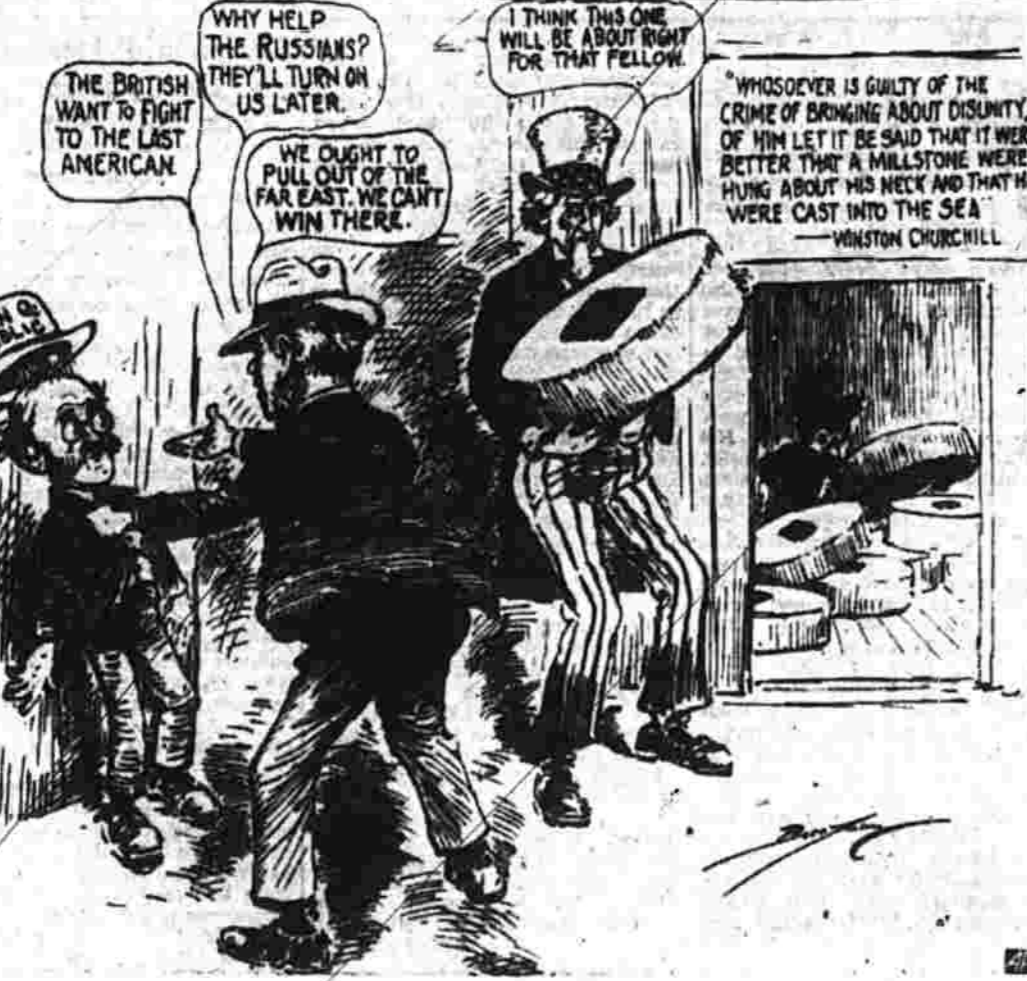
Picking up a copy of the Washington Evening Star, President Roosevelt at his press conference pointed to this front page cartoon and said the type of person it portrays is much in evidence in the nation's capital.