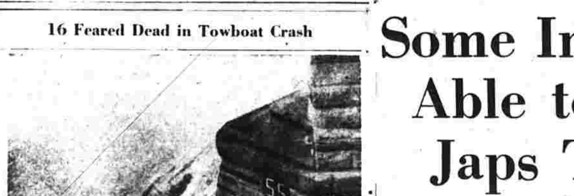
16 Feared Dead in Towboat Crash